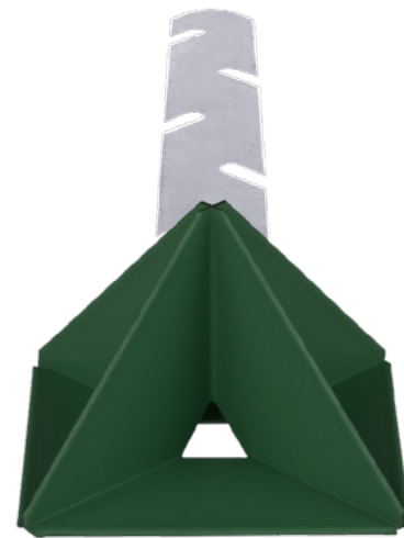
Slotted Tab Option for Retrofit Applications

*Seller assumes no responsibility for the warranty. Check your roof manufacturer's warranty information before installation.