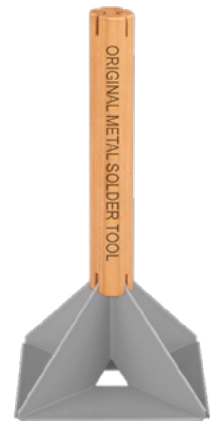
Zinc Material Shown

*Seller assumes no responsibility for the warranty. Check your roof manufacturer's warranty information before installation.