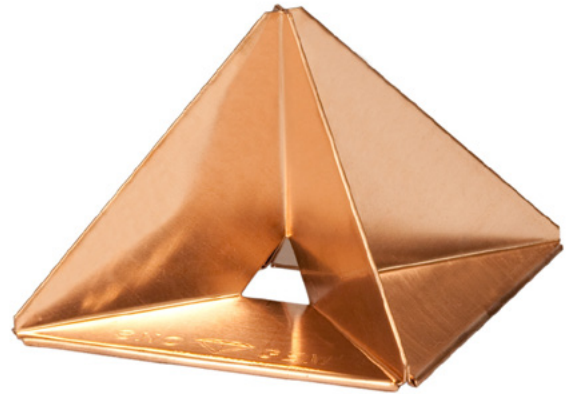
Copper Material Shown