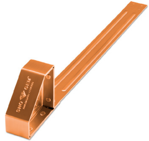
Copper Option Shown with Standard Tab End