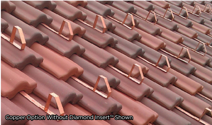
Copper Option Without Diamond Insert™ Shown