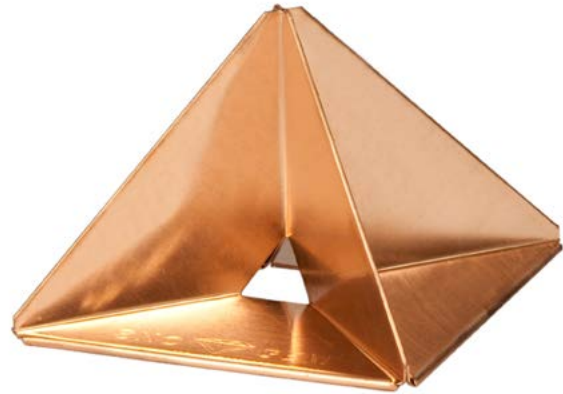
Copper Material Shown