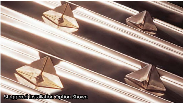
Staggered Installation Option Shown