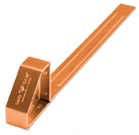
Copper Option Shown with Standard Tab End