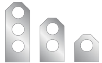
Triple Retention Bar Double Retention Bar Single Retention Bar