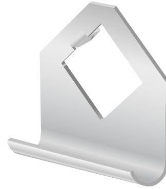
2" Square Single Retention Bar Option Shown