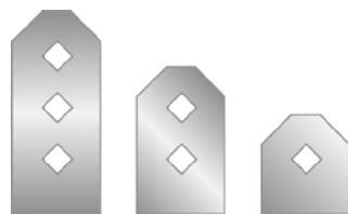
Triple Retention Bar Double Retention Bar Single Retention Bar