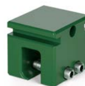
Sno Cube™ KLOC Mini