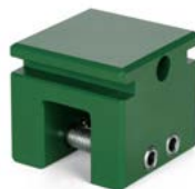
Sno Cube™ Mini