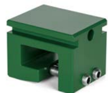
Sno Cube™ Wide

*Seller assumes no responsibility for the warranty. Check your roof manufacturer's warranty information before installation.