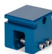
Sno Cube™ KLOC Mini