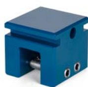
Sno Cube™ Mini