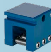
Sno Cube™ HD

All Sno Cubes™ also available in HD (Heavy Duty) with 5 set screws for heavy snow load applications.