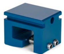
Sno Cube™ Wide

*Seller assumes no responsibility for the warranty. Check your roof manufacturer's warranty information before installation.