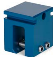
Sno Cube™ KLOC