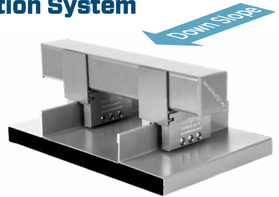
Typical 2" Sno Blockade™ Assembly