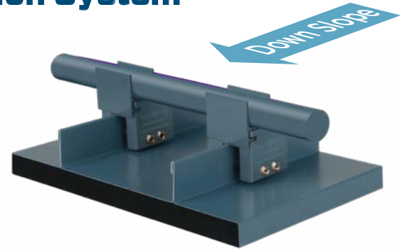
Typical 1" Round Sno Blockade™ Assembly