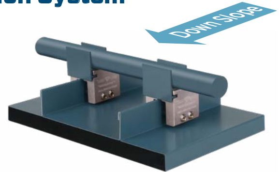
Typical 1" Round Sno Blockade™ Assembly