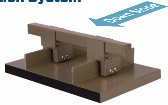
Typical 1" Sno Blockade™ Assembly