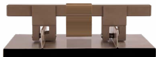
Blockade™ Plate Shown