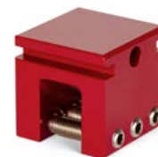
Sno Cube™ HD

All Sno Cubes™ also available in HD (Heavy Duty) with 5 set screws for heavy snow load applications.