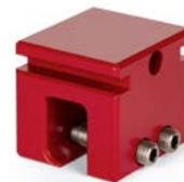
Sno Cube™ KLOC Mini