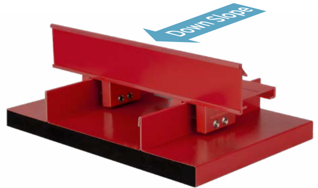
Typical 2" iClad-S™ Assembly