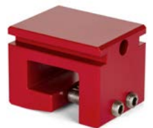
Sno Cube™ Wide