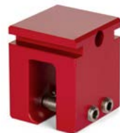
Sno Cube™ KLOC