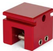
Sno Cube™ Mini