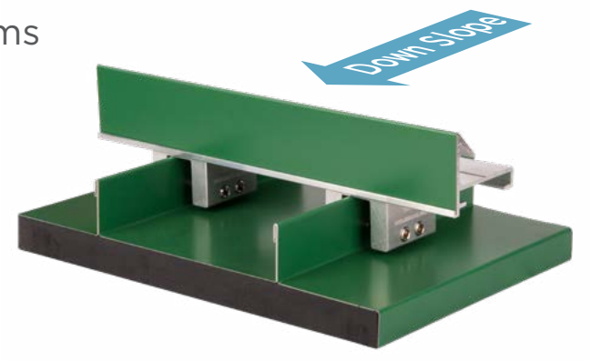
Typical 2" iClad™ Assembly