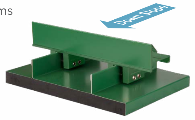
Typical 2" iClad™ Assembly