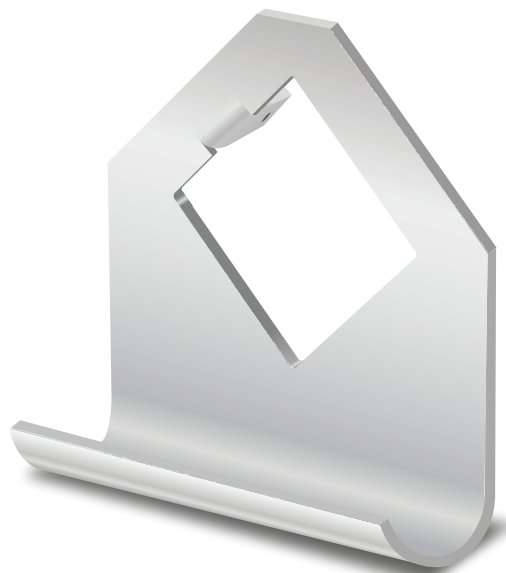
*2" Single Retention Bar Shown