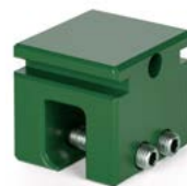
Sno Cube™ KLOC Mini