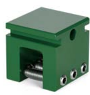
Sno Cube™ HD

All Sno Cubes™ also available in HD (Heavy Duty) with 5 set screws for heavy snow load applications.