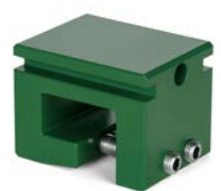
Sno Cube™ Wide