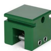
Sno Cube™ Mini