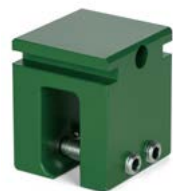
Sno Cube™ KLOC