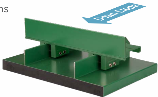
Typical 2" iClad™ Assembly